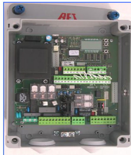
BFT Rigel 5 Control Panel

Gates Systems Ltd Tel 0800 32 88 198 Fax 0800 32 88 298 Email info@gates.uk.com